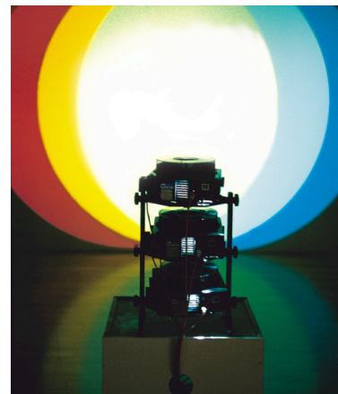
Susan Hiller 'Magic Lantern', 1987 Audio-visual installation: slide projections with synchronised soundtrack; 3 carousels each with 12 35 mm slides, driven by electronic pulses. Programme duration 12 minutes Dimensions variable. Edition 1/3