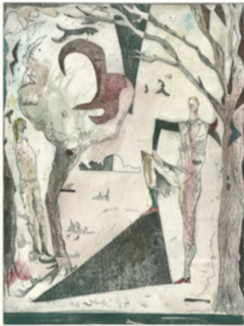
Volker Hueller Schneid , 2010 Etching, watercolor, shellack 36.5 cm x 46.5 cm