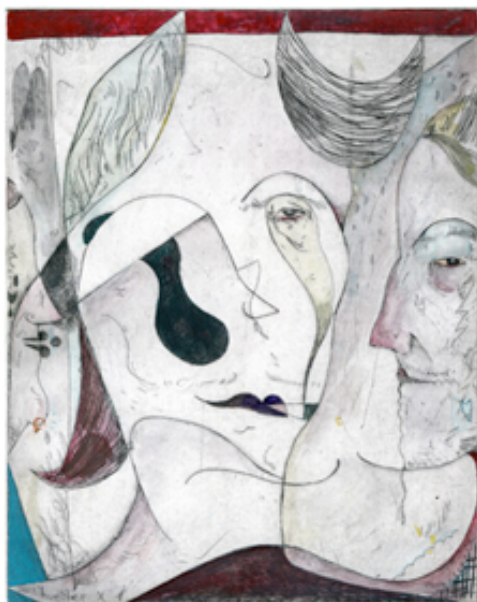
Volker Hueller Braindrain , 2010 Etching, watercolor, shellack 24 cm x 30 cm