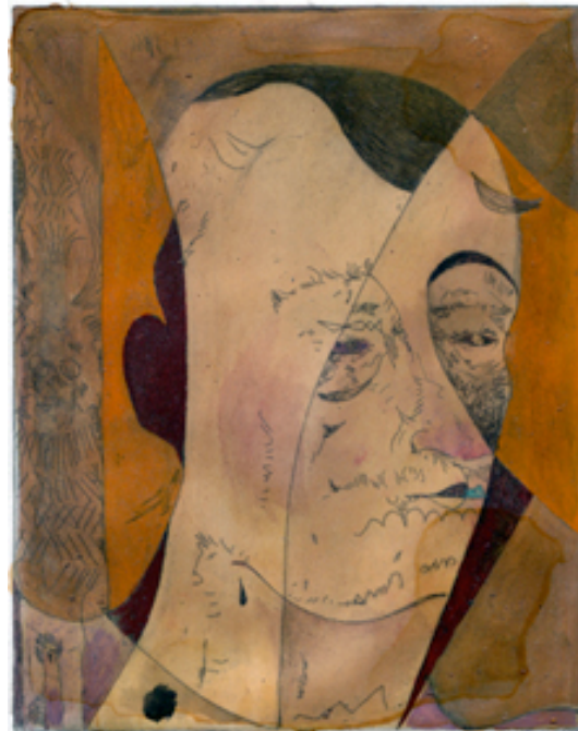
Volker Hueller Untitled (head) , 2010 Etching, watercolor, shellack 24 cm x 30 cm